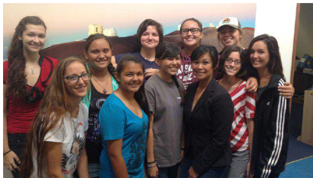
High school participants in the FY 2016 STARS workshop are pictured here. During the workshop they visited PISCES' headquarters, met with our engineers and learned from some of the best scientists and astronomers in the State.

The job training PISCES offers its interns is unparalleled and substantially impacts their future career and academic ambitions.