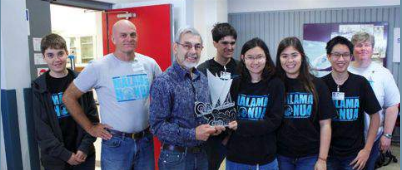
Members of the FY 2016 MoonRIDERS program

In FY 2016, PISCES continued to lead the collaborations with NASA Kennedy Space Center (KSC) and two Hawai'i high schools (Kealahou High School in Kailua-Kona, and 'Iolani High School in Honolulu).