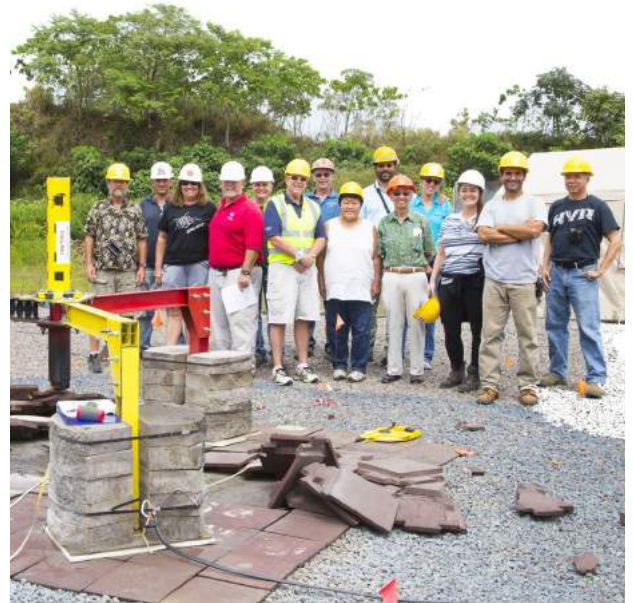
ABOVE: Partners and supporters of the VTVL project are seen here following PISCES/NASA's rocket engine firing test.

T he Vertical Take-Off/Vertical Landing Pad project was a highly ambitious endeavour successfully completed in collaboration with NASA Kennedy Space Center's Swampworks, Hawai'i County Research and Development, Honeybee Robotics and ODG Canada. The project was conducted under NASA's Advanced Construction with Mobile Emplacement (ACME) umbrella.