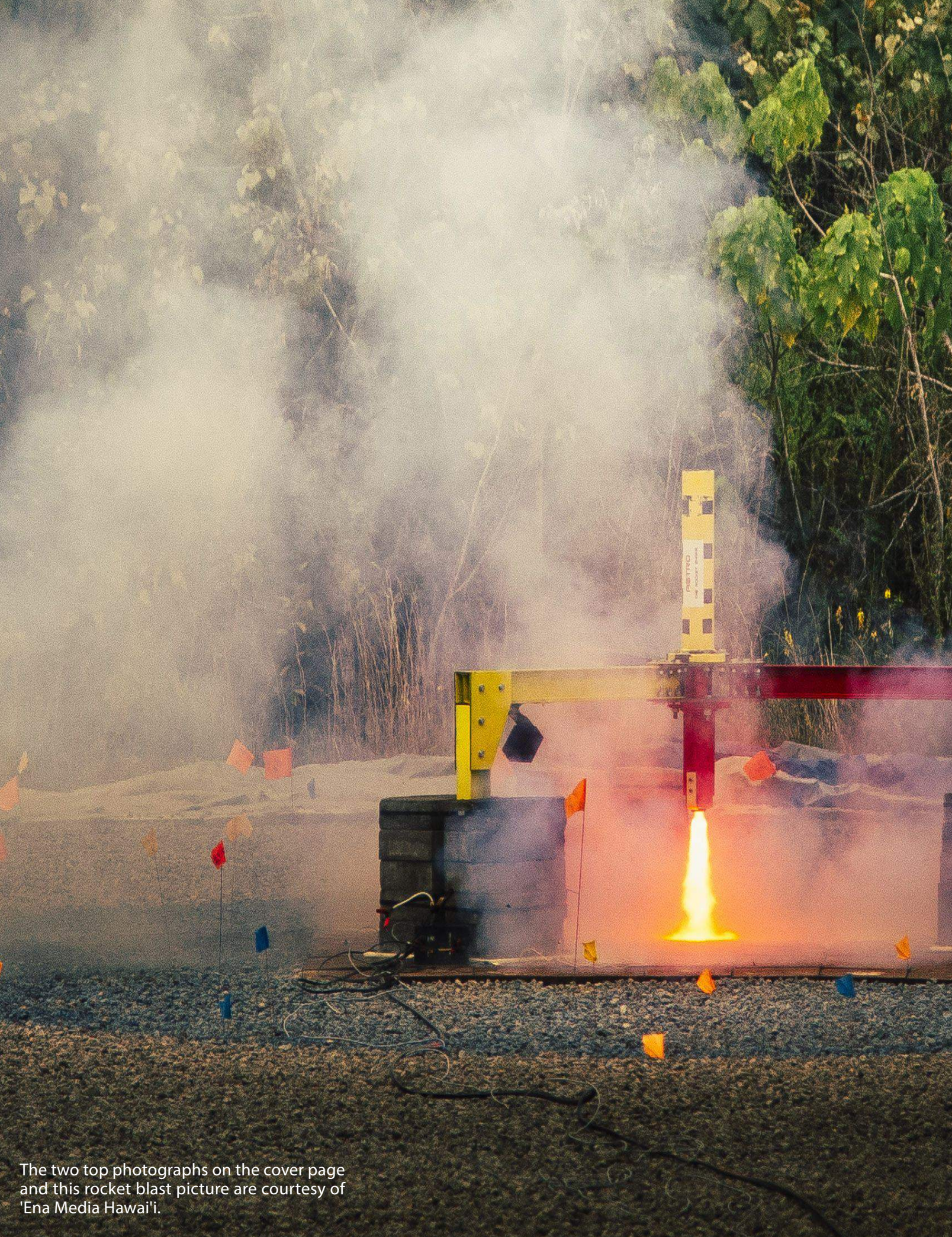
The two top photographs on the cover page and this rocket blast picture are courtesy of 'Ena Media Hawai'i.