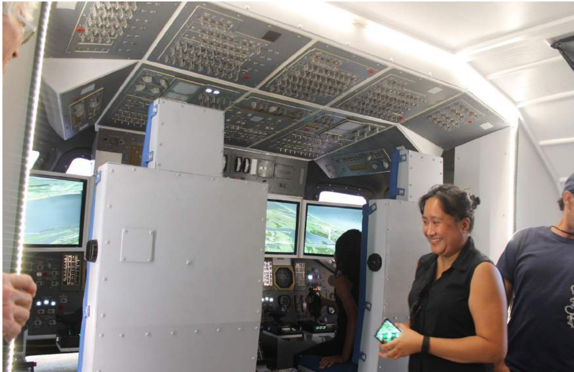
The image above shows members of the Hawai'i Island community checking out the reconstructed space shuttle cockpit at Kea'au High School.